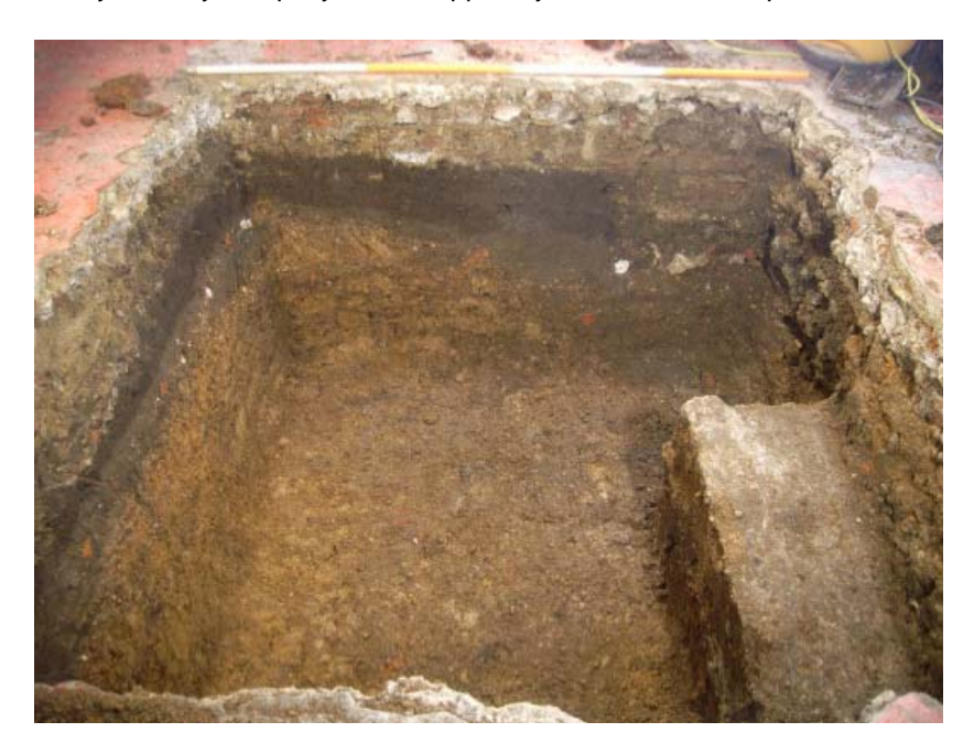
Plate 9: Test Pit 9 - Excavated profile

2.9.1 TP9 measured 2 m by 2 m and was excavated to a depth of c. 1.2m. Redeposited gravel was revealed at the base of the trench (121.96 m ATD). The gravel was part of a sequence of deposits which represent quarrying infill. The top of this sequence was at 122.86 m ATD. This was overlaid by an ashy dump layer and capped by Concrete make up and slab.