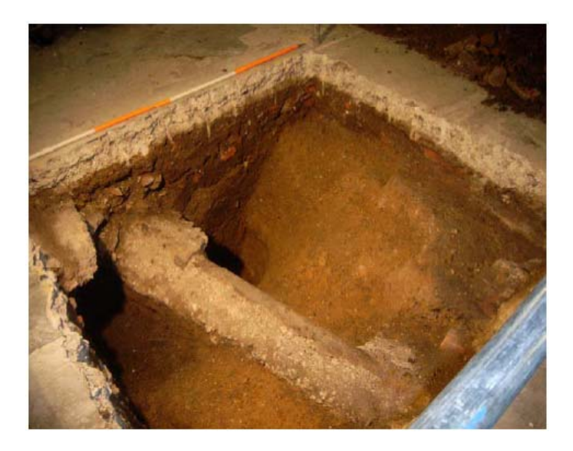
Plate 5: Test Pit 5 - Quarrying activity