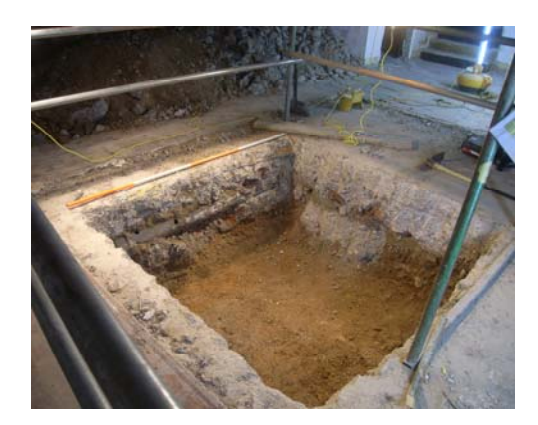
Plate 1: Test Pit 1 - Looking north west

2.1.1 TP1 measured 2 m by 2 m and was excavated to a depth of c . 750mm (top of natural recorded at 121.37 m ATD). Approximately 0.4m of concrete floorslab sealed the natural gravels of the area. One brick stanchion was recorded in a section.