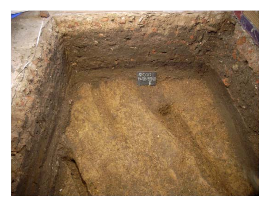
Plate 8: Test Pit 8 – Showing cart track impressions in redeposited gravel