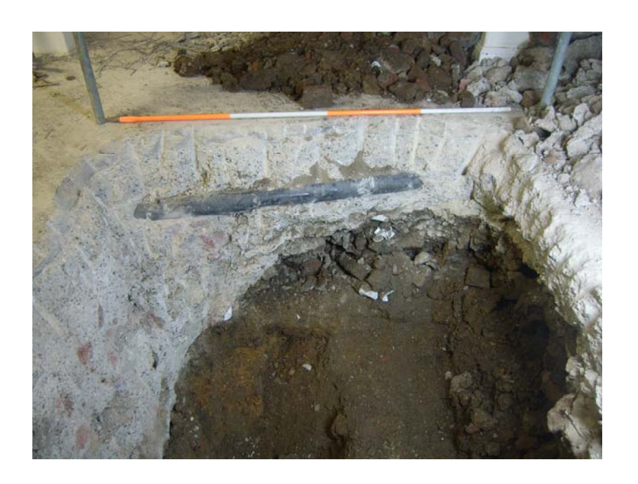
Plate 4: Test Pit 4 - Brick filled void beneath concrete slab