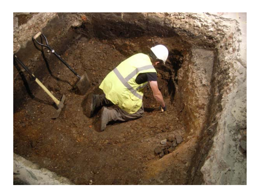
Plate 3: Test Pit 3 - Quarrying cut under excavation