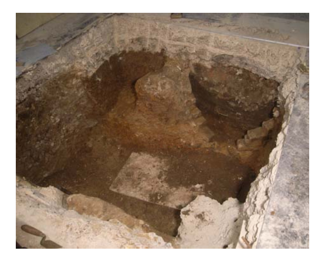
Plate 2: Test Pit 2 - Looking east.

Probable robber trench 202 runs from left to right at the foreground of the test pit.