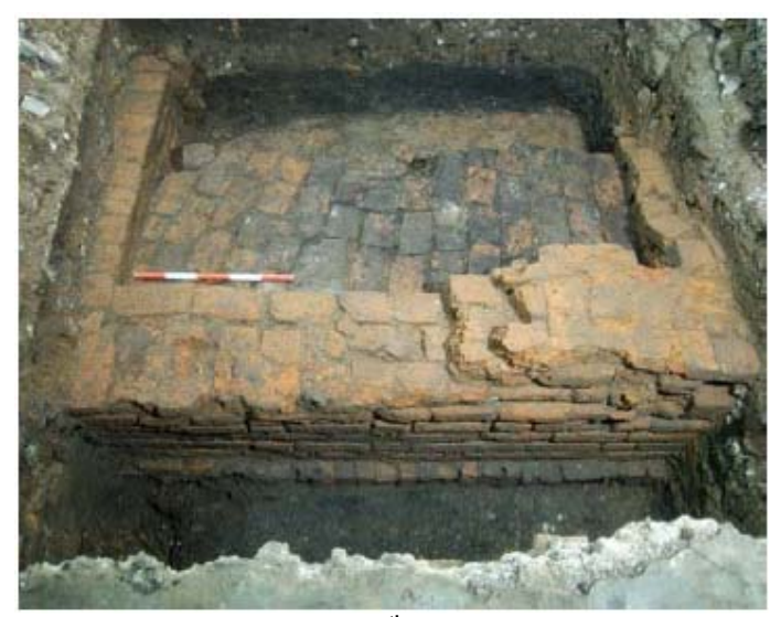
Plate 6: Test Pit 6 - Late 17th century (?) building