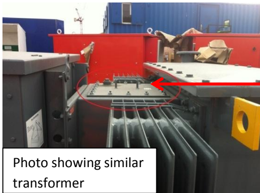
Photo showing similar transformer