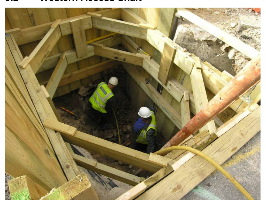
Photo 3 Western Access shaft, removing 19/20th-century building foundations and north–south aligned wall [20], looking south-east