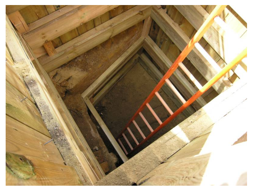
Photo 7 London Wall heading, 20th-century wall aligned east—west, looking southwest

A mid 20th-century wall was recorded in an additional access shaft, located on the junction of London Wall and Moorgate (Photo 7). Initially this was identified by the principal contractor as part of the City Wall (a Scheduled Monument), that shares the same alignment as the modern street (section 6). However, closer examination revealed this wall to be of a much later date, and consequently not archaeologically significant. The deposits uncovered in the surrounding heading trenches represent 20th-century concrete foundations, previous utilities work (including a 'live' manhole) and associated layers of make up for the existing basement structure and structure of the surrounding buildings.