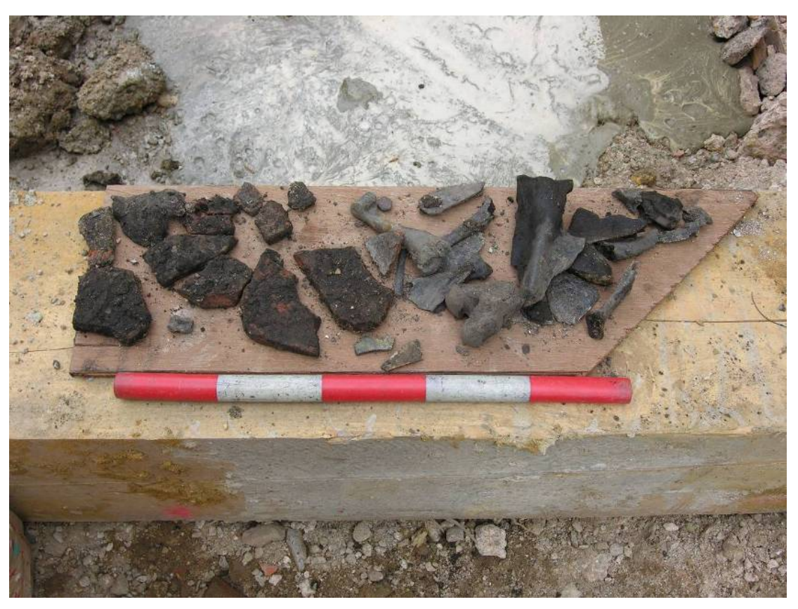
Photo 12 Selection of finds from the mini raking pile between 111.65m ATD and 111.15m ATD, most likely from a post-medieval pit or dumped deposit