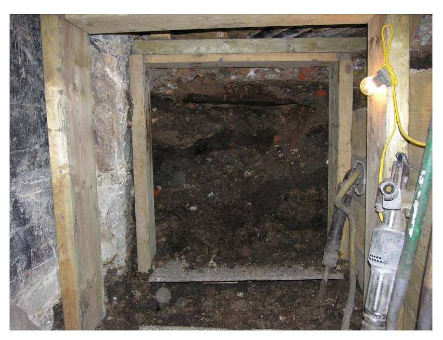
Photo 5, London Wall heading tunnel, post-medieval layers (possibly the City Ditch [25]–[27], looking north