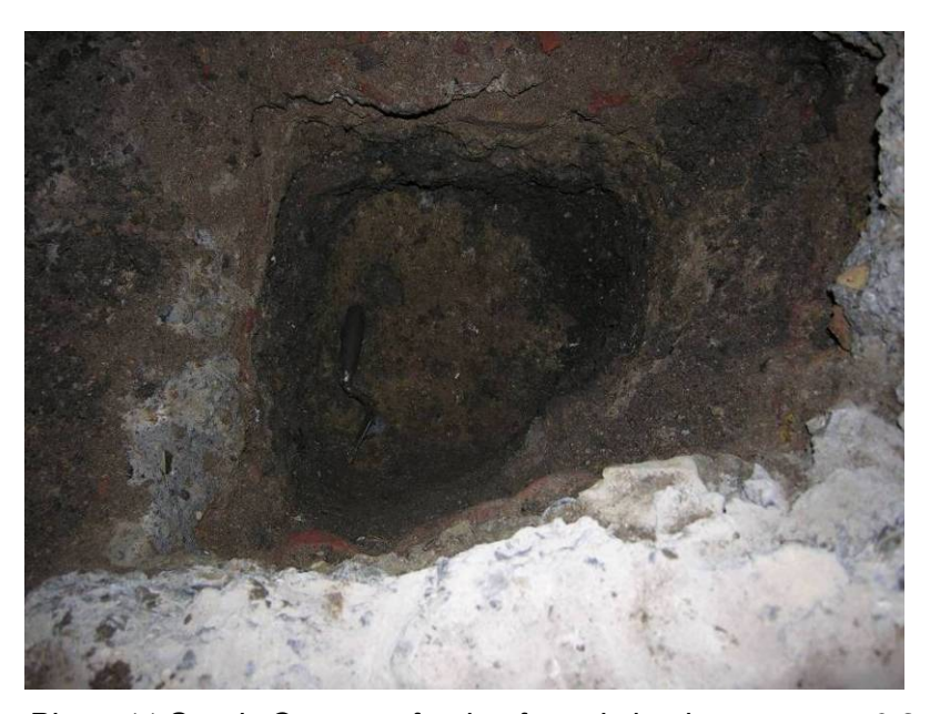
Photo 11 Sandy Concrete footing for existing basement at 0.9m bGL, looking south