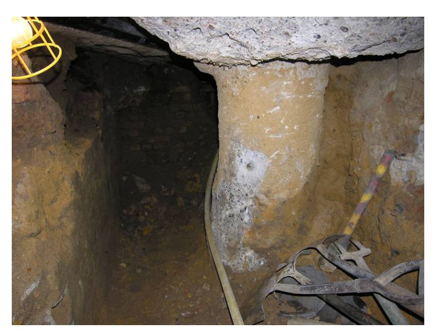
Photo 4 Excavated tunnel approximately mid way between western and eastern access shafts. Modern foundations truncating earlier stock brick wall, looking east

[20] suggest it was of a structural nature. Along its eastern edge concrete had been poured, and had moulded around the wall, this was evidently done at a later date, and may be associated with the relativity recent foundations of Moor House to the north-east.