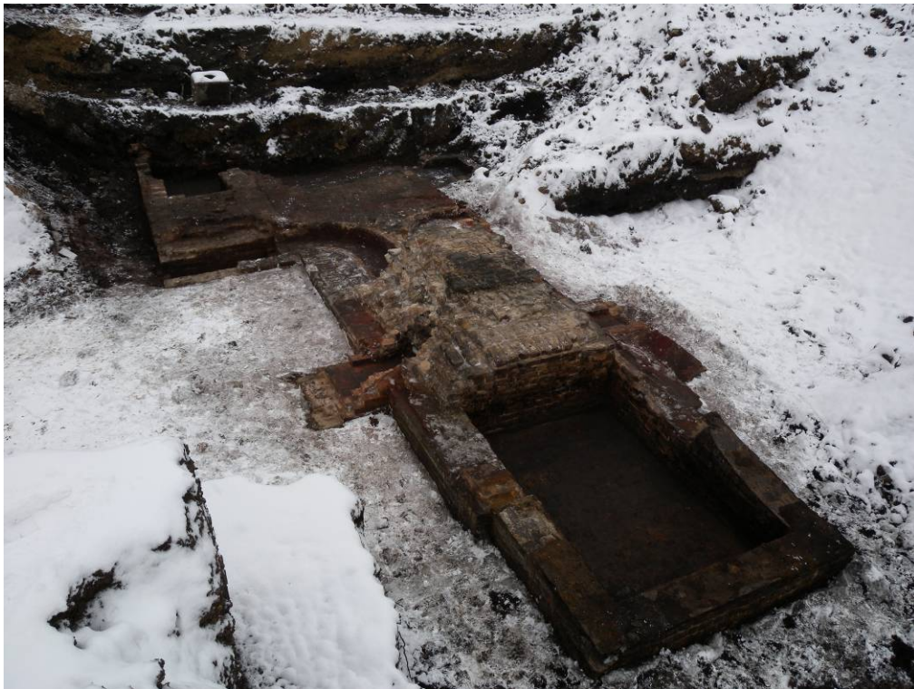
Trench 2 extension, looking south-west (above) and north (below), showing structure [31]