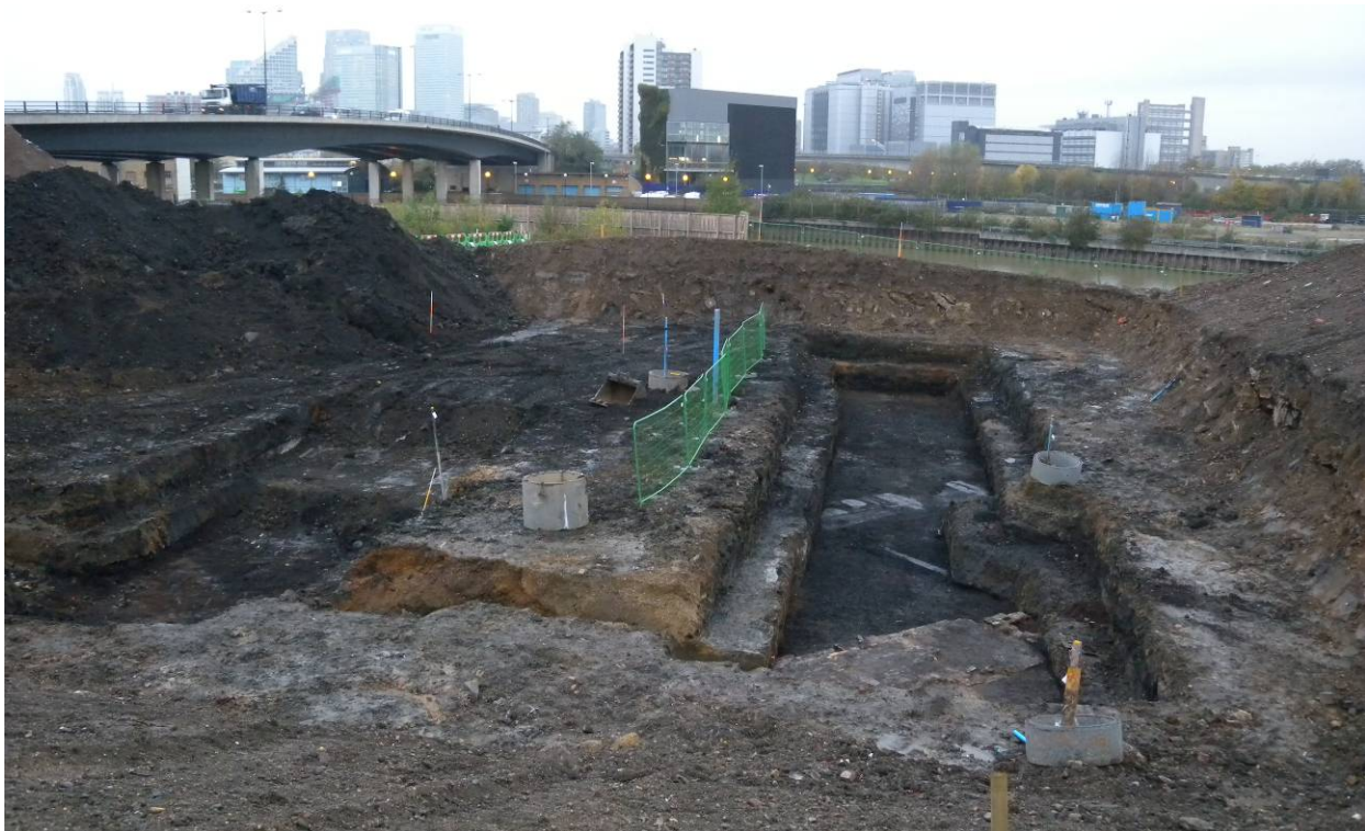
Trench 1 (right), looking west, with Structures [12] and [13] (front) and timbers [16] & [15] and concrete pads [14] (centre)