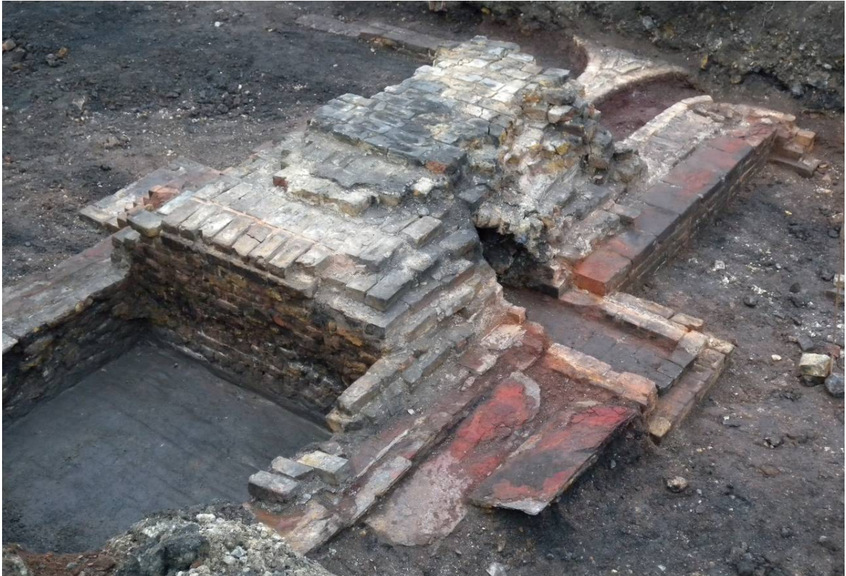
Trench 2 Structure [31], looking south-east (above) and north (below), showing parallel flues and brick floored chamber