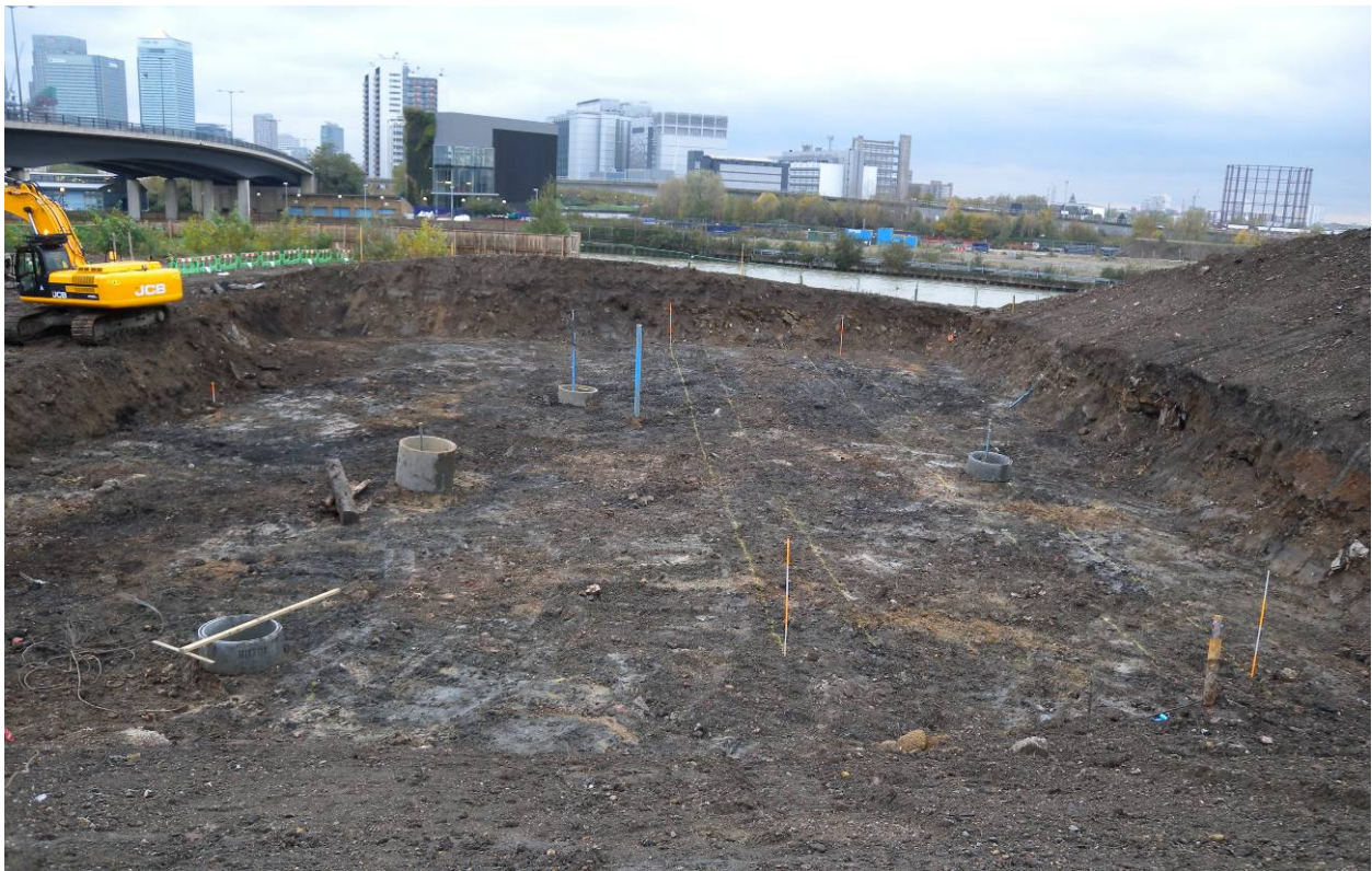
Area at Limmo Peninsula reduced from 107m ATD (7m OD) to 105m ATD (5m OD), looking west

Ground reduction (107m ATD to 105m ATD), and the removal of DLR rubble and overburden was monitored by MOLA Senior Archaeologist. The DLR rubble was very mixed clay and silt containing frequent small to large concrete fragments, timber beams and modern rubbish, including plastics. No archaeological features were encountered.