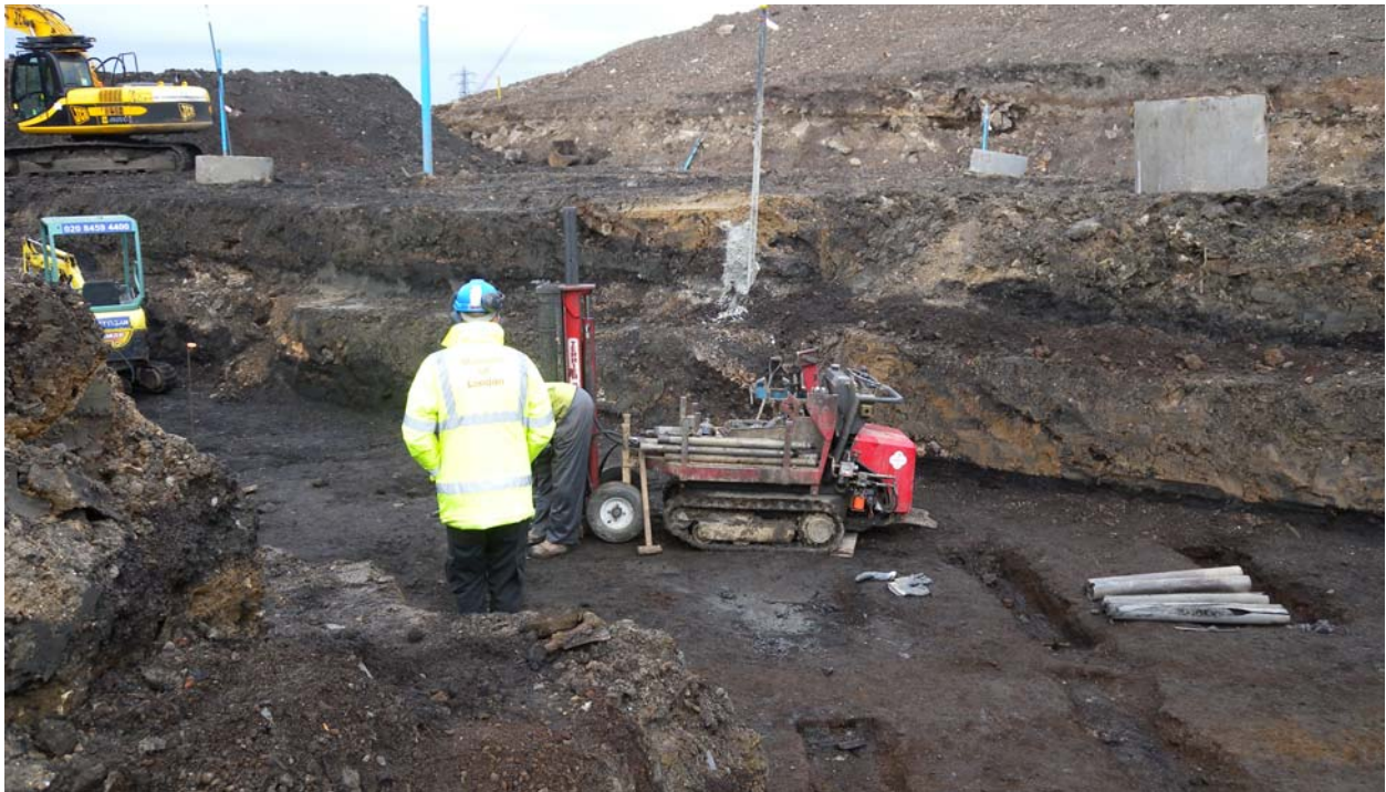
Trench 2 with terrier rig in operation, looking north-west