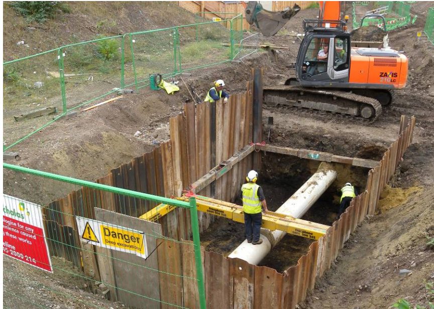
Eastern stopple pit, looking south-west (above) and base of eastern stopple pit, looking north-east (below)