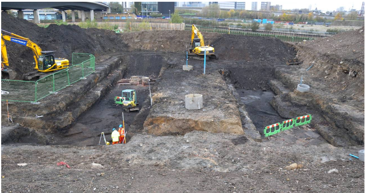
Trench 2 (left), looking west, with timber baseplates with concrete [32] & [33] and timber sleepers (front) and brick structure [31] (rear)