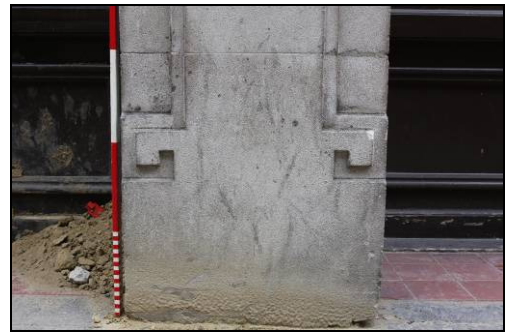
Figures 3-4: Architectural details of 97-99 Dean Street