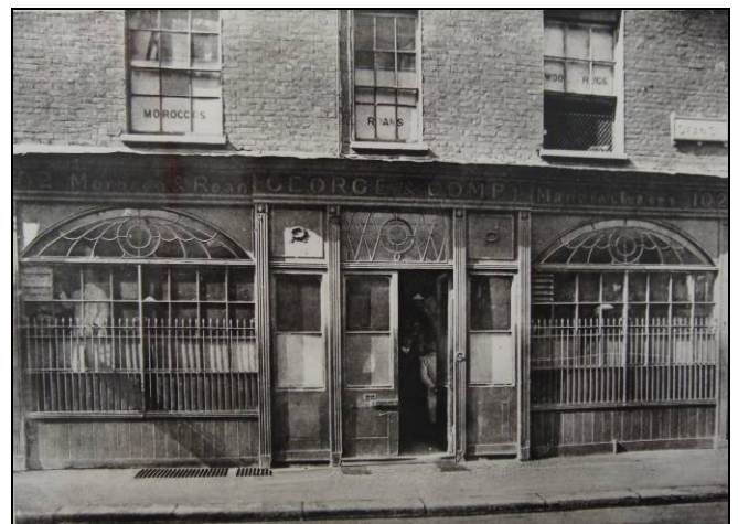
Figure 6: 1920s photograph of 102 Dean Street

Sheffield Office: Unit R6, Riverside Block, Sheaf Bank Business Park, Prospect Road, Sheffield S2 3EN. Tel: 0114 255 9774 Maidstone Office: The Malthouse, The Oast, Weaving Street, Maidstone, Kent ME14 5JN. Tel: +44(0) 1622 739381