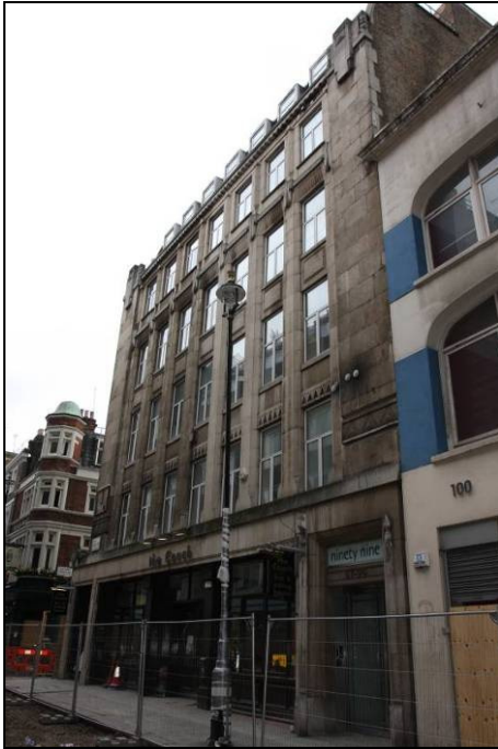
Figure 2: General view of 97-99 Dean Street

Tel: 01722 326867 Fax: 01722 337562 info@wessexarch.co.uk www.wessexarch.co.uk