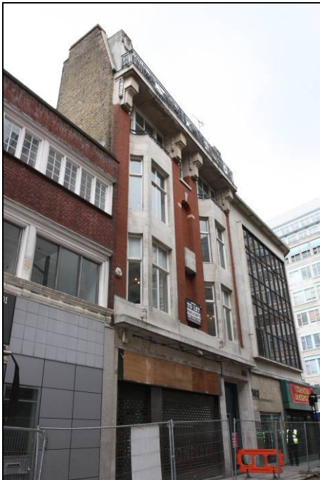
Figure 5: General view of 102 Dean Street