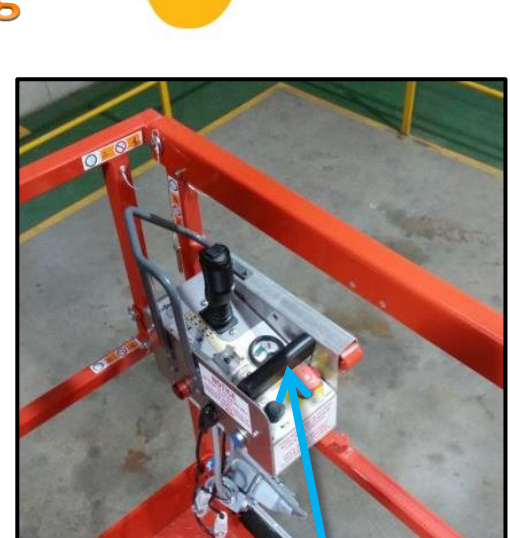
Sensor bar ergonomically situated in front of the joystick/controls

For more information, please contact Darren Phillips: darren.phillips@kimberlygroup.co.uk